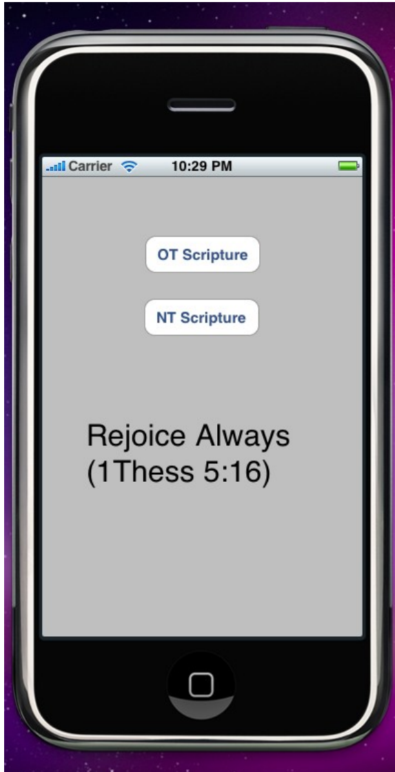
(after top button touch)

2. Make a copy of your scripture-button1 project and name the copy scripture-button2. Make modifications to scripture-button2 so that there are two buttons (an Old Testament button and a New Testament button) and pressing either button puts an Old Testament or New Testament scripture in the label. A screen-capture shows an example after touching each button: