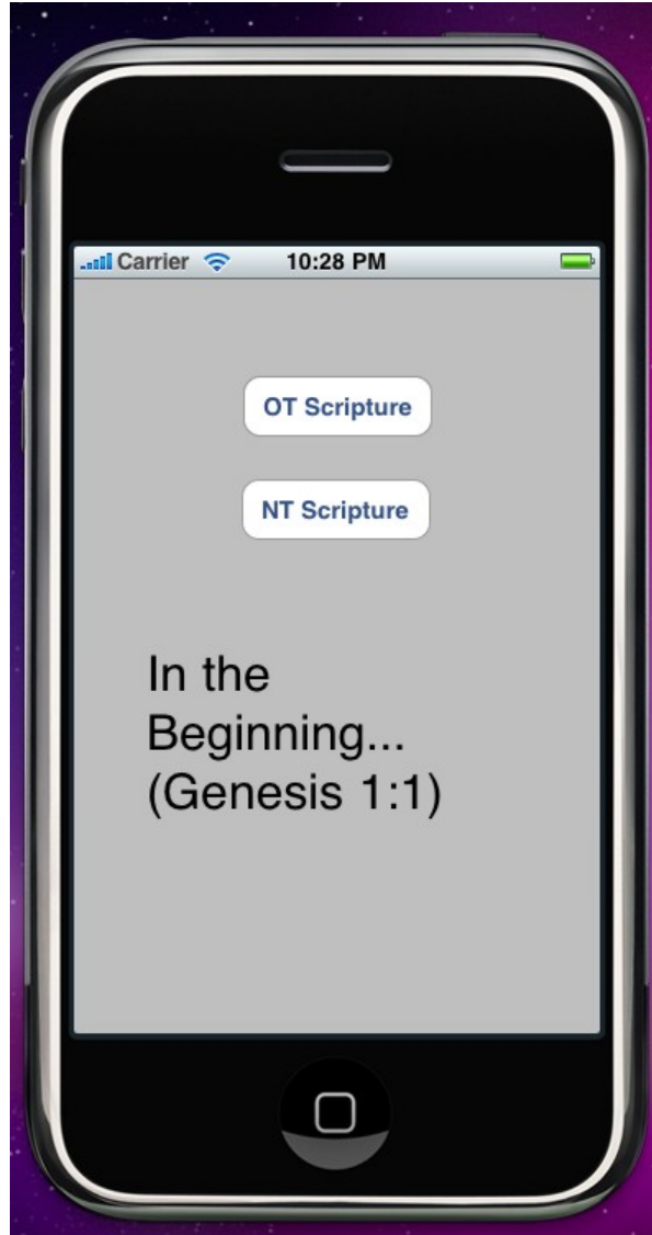
(after bottom button touch)

3. Make a copy of your scripture-button2 project and name it scripture-button3. Modify scripture-button3 so that there are two OT buttons and two NT buttons that result in four different scriptures showing up in the label.